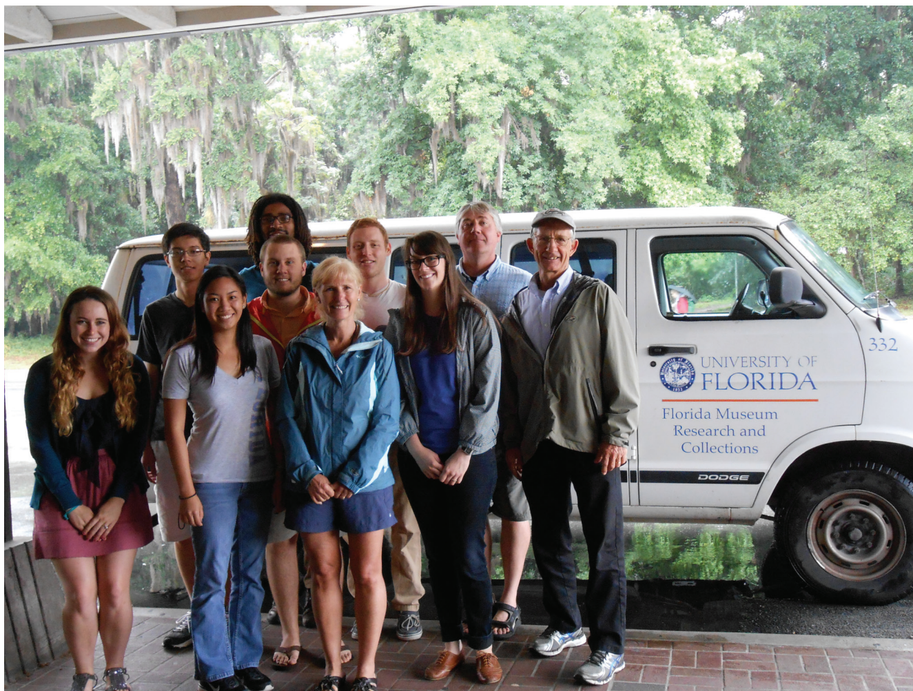
Figure 3. University of Florida undergraduate biology students on a museum field trip to collect plant specimens at the Orndway-Swisher Biological Station.

data. If they desire to do so, instructors can enhance the comparative component of the exercise by having different student groups focus on different plant species or conceptual issues. By coordinating with other instructors to conduct this exercise simultaneously at multiple institutions, students from different programs can interact online to enhance learning, foster interactions, and develop a collective and more collaborative perspective on scientific problem solving.