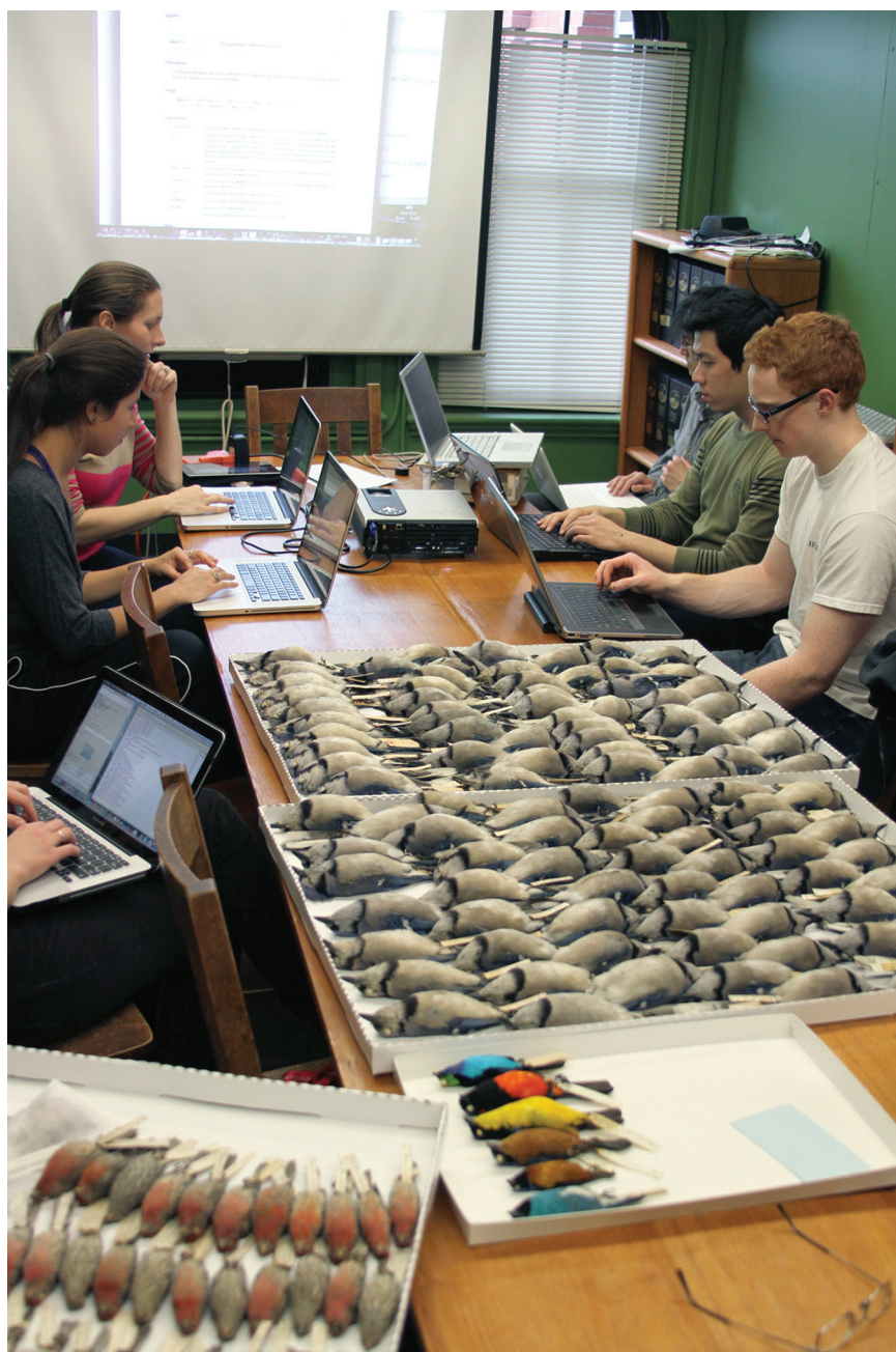
Figure 1. Undergraduate students at Harvard use specimens and associated data to explore speciation and molecular evolution in spring 2013.