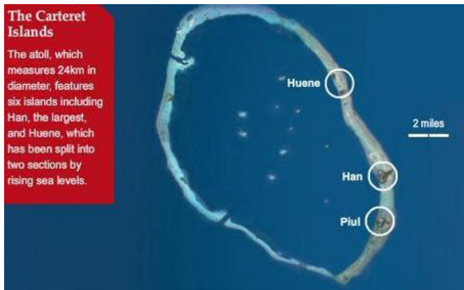
Image adapted from www.telegraph.co.uk/earth/carteret-islands/6771651/The-sea-is-killing-our-island-paradise.html

The Carteret Islands (also known as Carteret Atoll, Tulun or Kilinailau Islands/Atoll) are located 86 km (53 mi) north-east of Bougainville in the South Pacific. The Islands are an atoll (an archipelago of coral islands) made up of six islands: Lesala, Lolosa, Huene, Han, Piul, and Lagain. The entire atoll measures 24 km (15 mi) in diameter and encompasses a total land area of 0.6 square kilometers. The highest point in the Carteret Islands measures 1.5 m (5 ft) above sea level. This low elevation above sea level makes the Islands and its people particularly susceptible to the adverse impacts of climate change. For example, rising sea levels in the 1980s divided the Huene Island into separate parts. Additionally, episodic storm surges and high tides have demolished homes, decimated vegetation and arable land, and contaminated fresh water sources with salt water. Moreover, the coral bleaching that result from increased sea water temperatures poses a tremendous long-term threat to this chain of coral islands.